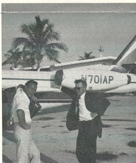
Arnold Palmer discusses last minute details with Arch Sweeney, vice president in

An unspoiled paradise, Eleuthera is a 100 mile long narrow (about 5 miles wide) island offering a two ocean choice. The island fronts the splashing Atlantic surf, and in some places only 24 feet separate it from the calm Caribbean. The pink sand beaches are the world's loveliest. Rich in farming, Eleuthera is often called the garden island of the (Continued on reverse side)