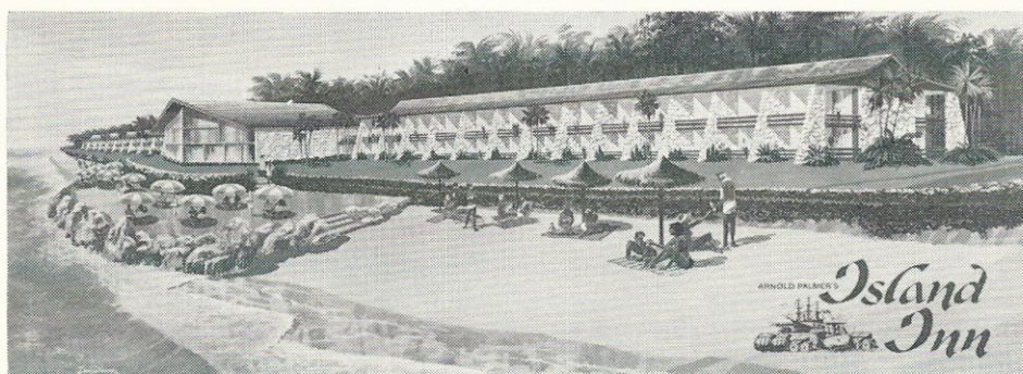
Artist's conception of Arnold Palmer's Island Inn, Eleuthera Island, Bahamas. The hotel is under construction and plans already are set for others to be built on different islands in the Caribbean.

The two-story, double wing structure, comprising 75,000 square feet, will have the utmost in modern conveniences yet retain the island's old world charm.