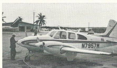
Arnold Palmer's Aero Commander Jet and Indian Lake Aviation's Twin Beechcraft at Peak Sound International Airport.