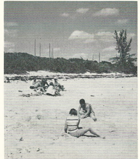
First family outing on the Island Inn beach included lunch, swimming and snorkeling on the beautiful coral reef.

At this point there seems to be no limit to the success of Arnold Palmer Inns.